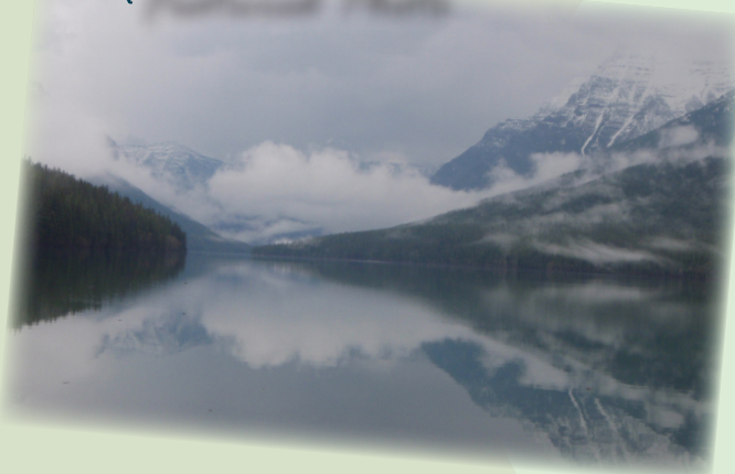
Bowman Lake Anonymous