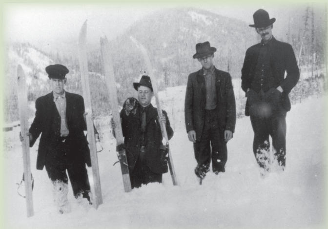
Winter in Glacier; Men returning from a ski trip